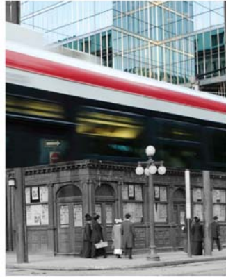
Image: Part of King and Simcoe 1919/2012 triptych from the TorontoTIME series by Harry Enchin www.torontotime.com