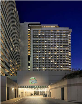
Chelsea Hotel, Toronto