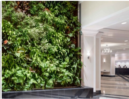
Living Green Wall/Vertical Garden