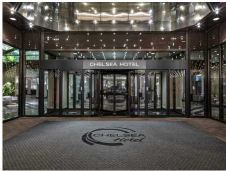
Chelsea Hotel, Toronto

As Canada's largest hotel with 1,590 guest rooms, the Chelsea Hotel, Toronto, is centrally located and just steps from the city's best shopping districts, world-class theatres, vibrant nightlife and exciting attractions. A full-service urban resort, the Chelsea Hotel has room types to suit everyone and the hotel offers two restaurants, separate adult and family recreation areas and pools – including the "Corkscrew" - downtown Toronto's only indoor waterslide. As a premier family destination, the hotel offers a full range of services including the Family Fun Zone with Camp Chelsea, Kid Centre and Club 33 Teen Lounge. The Chelsea Hotel, Toronto is an independent property as part of the Langham Hospitality Group's international portfolio of hotels and resorts. For more information about the Chelsea Hotel, Toronto, please log on to www.chelseatoronto.com .