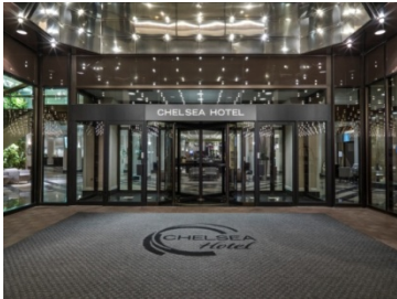
Chelsea Hotel, Toronto

As Canada's largest hotel with 1,590 guest rooms, Chelsea Hotel, Toronto, is centrally located and just steps from the city's best shopping districts, world-class theatres, vibrant nightlife and exciting attractions. A full-service urban resort, the Chelsea Hotel has room types to suit everyone and the hotel offers two restaurants, separate adult and family recreation areas and pools – including the "Corkscrew" - downtown Toronto's only indoor waterslide. As a premier family destination, the hotel offers a full range of services including the Family Fun Zone, which includes the Kid Centre and Club 33 Teen Lounge. Chelsea Hotel, Toronto is an independent property as part of the Langham Hospitality Group's international portfolio of hotels and resorts. For more information about Chelsea Hotel, Toronto, please log on to www.chelseatoronto.com .