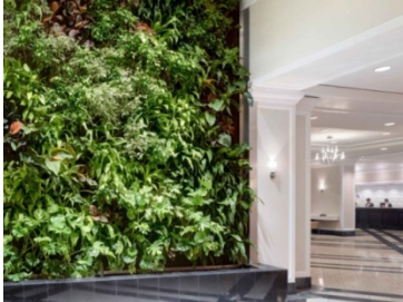
Living Green Wall/Vertical Garden