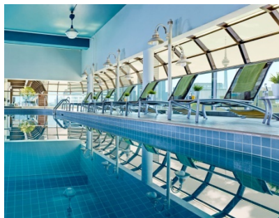
Deck 27 Pool/Fitness Centre