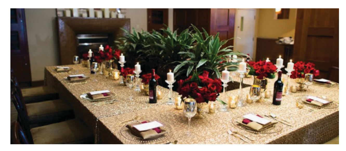
Our Bb33 Bistro and Brasserie is the ideal private event venue for an engagement party, rehearsal dinner, intimate wedding reception or thank-you breakfast. This unique space provides warmth and comfort without the need for over-the-top décor.