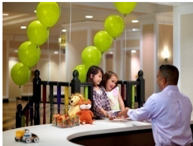
Kid's Check-in Desk