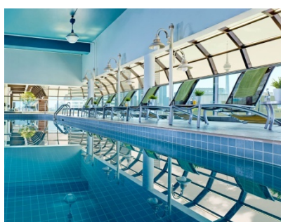
Deck 27 Pool/Fitness Centre