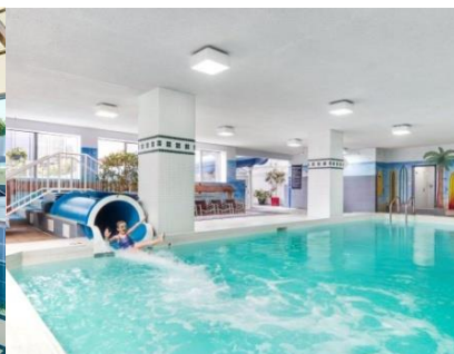
Family Fun Zone