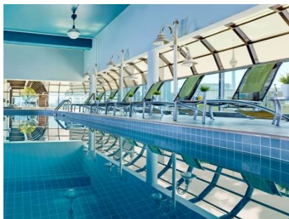
Deck 27 Pool/Fitness Centre